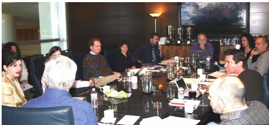
ARO 2007 Council meeting work session.