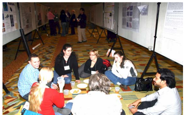
Attendees gathered in the poster hall during the Welcome Reception sponsored by Springer.

c) To allow the participation of those who cannot travel, reviewing is already sometimes handled by telephone and may eventually move toward web-based media.